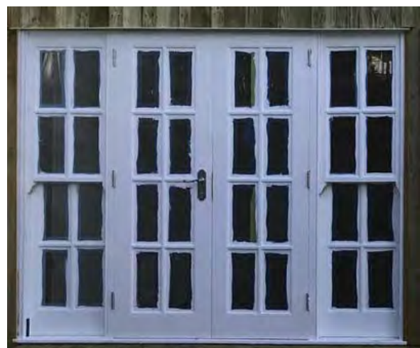
What the client got