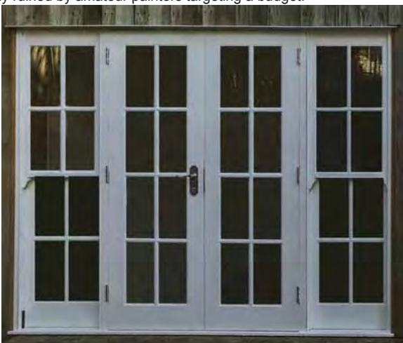
What the client wanted

Apply caution, and clarify the qualifications when using internet-based labour suppliers such as Airtasker, Taskrabbit, HiPages, Service Seeking etc as you have no idea of the competence of the people that can answer your enquiry, and we have witnessed some horrific outcomes where good joinery has been totally ruined by amateur painters targeting a budget.