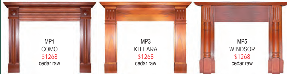
MP1 COMO $1268 cedar raw

Prepriming white or clear $136 Balmoral Mantle shown with cast iron baffle