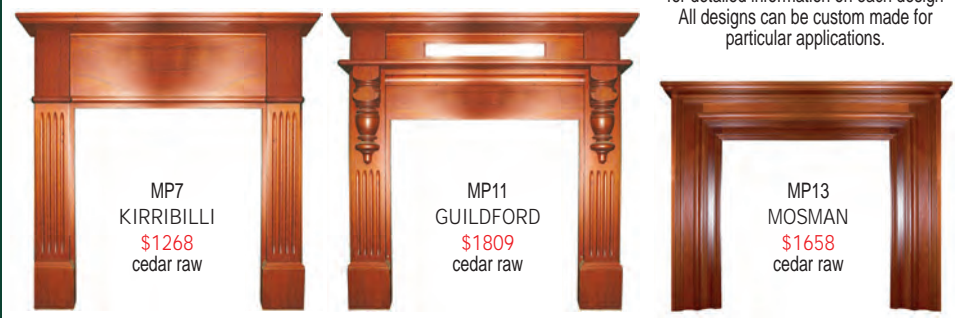
MP7 KIRRIBILLI $1268 cedar raw