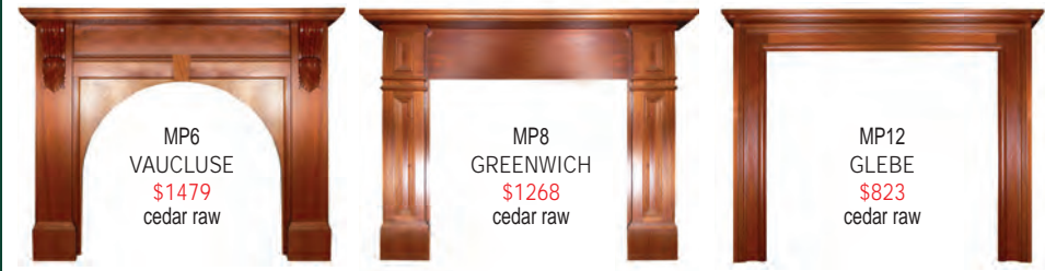
MP6 VAUCLOSE $1479 cedar raw