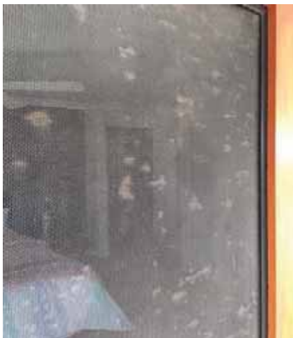
Dirt build up on a woven S.S. mesh

All metal mesh screens have a problem with electrostatic action between the mesh and airborne salts. The common solution is to regularly remove salt build up with high pressure water blasting and to seek to isolate the metal from the salts with a silicon or wax layer. There are many different forms of wax coating available commercially, ranging from Mr. Sheen to automotive wash and wax products. There are also commercially available silicone sprays sold by automotive retailers. All mesh screens trap dust and airborne particles attracted by electrostatic interaction as breeze passes through the mesh. If this impurity builds up and is not regularly removed, it will encrust the screen irreparably. There are also fungal moulds that can grow in patches on mesh caused by airborne spore. Obviously, screens in coastal locations are more vulnerable to salt attack than hinterland locations and maintenance is a bigger issue. Similarly, locations near dense vegetation have greater risk of fungal spots (which are often mistaken for rust spots) and can be eliminated by antimould and a topcoat of silicone spray. Woven screens intrinsically entrap more particles than perforated screens but the problems are the same and regular maintenance is the only prescription for long term durability.