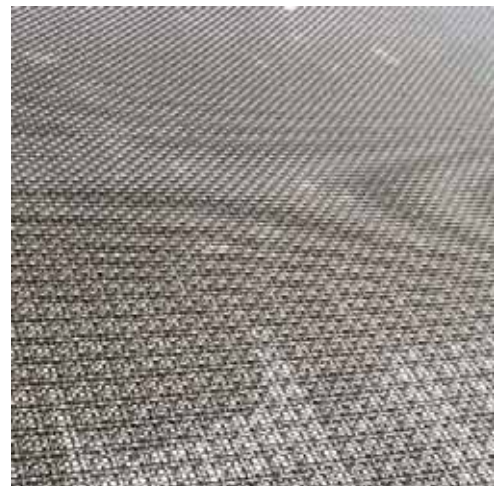
Mould patches on woven S.S. mesh