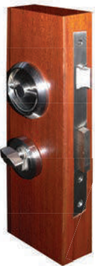
example of flush ring turn operating a latch lock