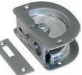
503S polaris privacy latch