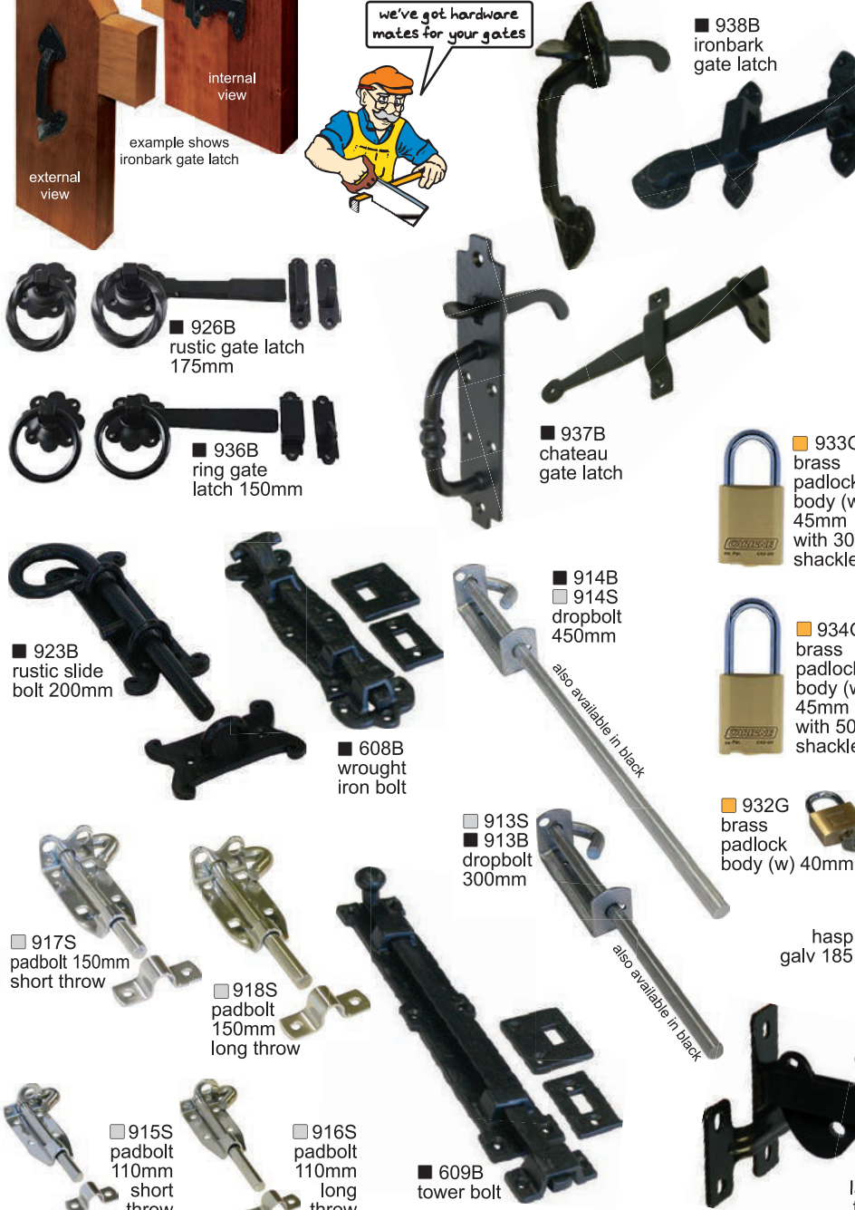
938B ironbark gate latch