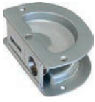
502S polaris passage pull