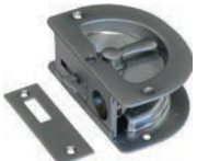
501S polaris latch