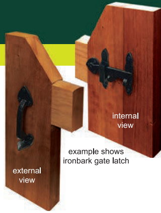
external view internal view example shows ironbark gate latch